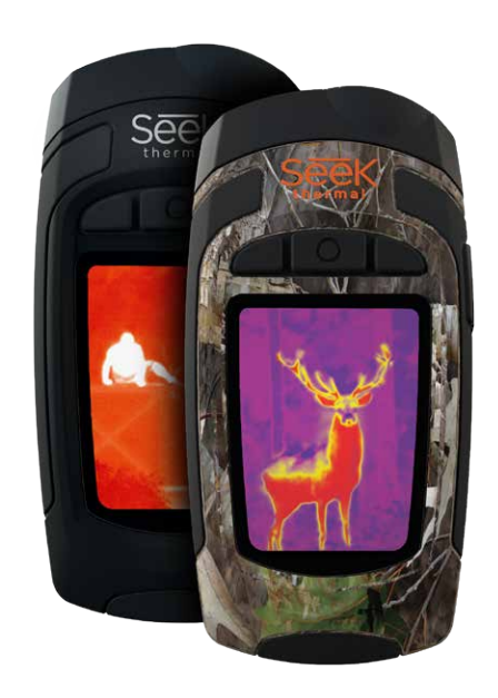
Available in TrueTimber® Kanati Camouflage and Pure Black

As a long range, all-in-one thermal imaging camera with a 20-degree narrow field of view, the RevealXR boasts the same accurate thermal 206x156 sensor and powerful 300-Lumen LED flashlight as the Reveal, with the added benefit of extra range detection. Its intuitive, single-handed interface and button control make it ideal for security, safety and hunting in both light and dark conditions. Its fixed focus detects heat at distances of up to 900 feet. The RevealXR combines powerful technology, rugged design and a long-lasting battery to provide thermal insight whenever you need, wherever you are.